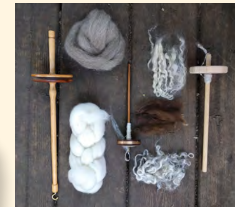
ABOVE: Drop Spindle supplies used in the workshop with Emily Wohlscheid

Expand upon the traditions of quilt making to incorporate contemporary materials and techniques with artist TJ Schwartz! Students will learn the basic process of quilting before they push the boundaries, exploring organic shapes, repurposed fabrics, and found objects. Students will walk away with a finished wall piece.