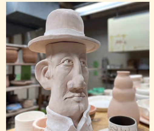
ABOVE: Bisque-fired sculpture created by Clay Artist Guild Member