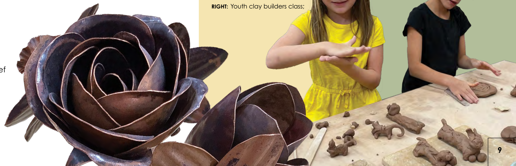
ABOVE RIGHT: Youth classes working with the color wheel. RIGHT: Youth clay builders class;

AGES 18+ (8) THURSDAYS, 6 – 8:30 PM JANUARY 25 – MARCH 14 Tuition: $210/$190 Members, Materials Fee: $50 John DeLapa