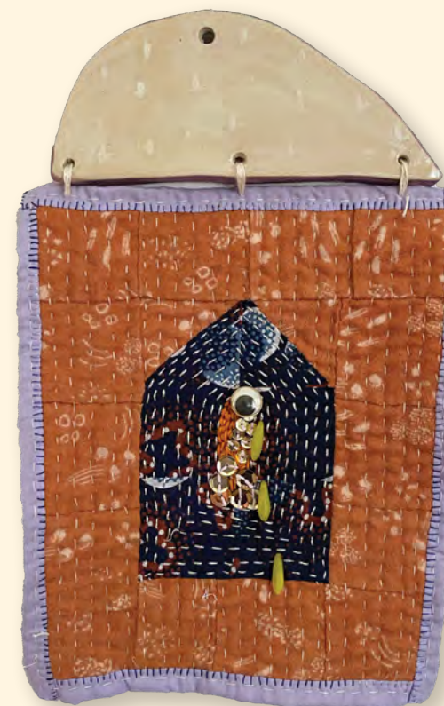
ABOVE: Contemporary weaving incorporating ceramics, found fabrics, and googly eyes by TJ Schwartz