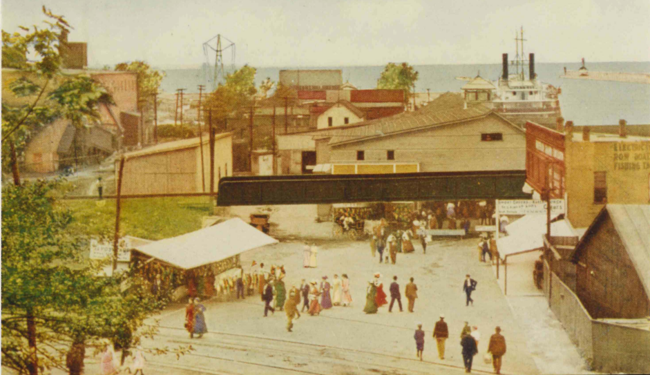
HARBOR AND STEAMSHIP DOCKS, ST. JOSEPH, MICH.