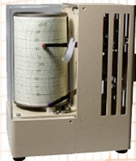
Hygromograph and graph paper.

KAC's exhibition sponsors, your membership, and visitor donations support expenses associated with gallery improvements like these and help bring quality exhibitions to KAC.