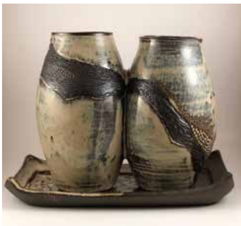
Top Right: KAC Teaching Artist Noelle Ringer. Bottom Right: Noelle Ringer teaching students in Introduction to Wheelthrowing. Left: Noelle Ringer's wheel-thrown vessels.