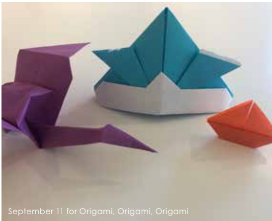
September 11 for Origami, Origami, Origami