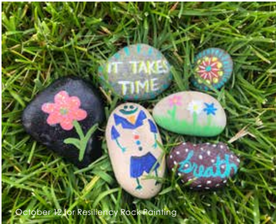
October 12 for Resiliency Rock Painting