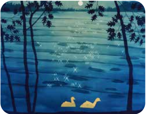
Casey Roberts, moon lit (river without end) . Cyanotype on paper with collage, 2018.

Visit https://krasl.org/education/adult/classes/ to register.