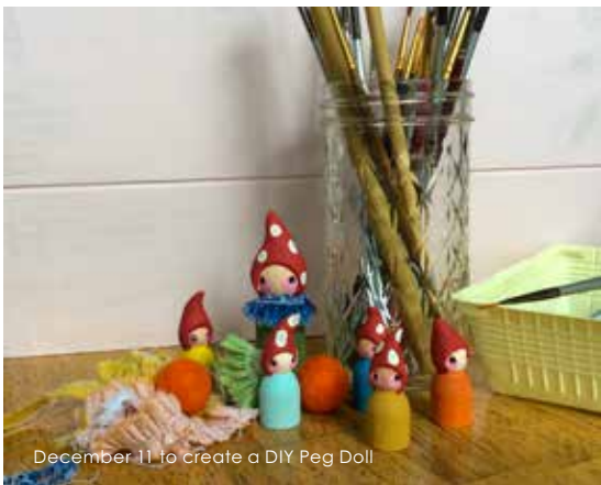
December 11 to create a DIY Peg Doll