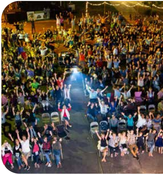
Join in the Chit Chat at this year's Pecha Kucha!

TUESDAY, OCTOBER 8, 5:30 PM FREE & OPEN TO THE PUBLIC