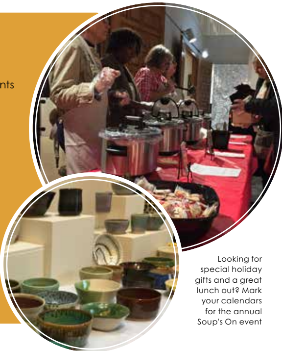
Looking for special holiday gifts and a great lunch out? Mark your calendars for the annual Soup's On event

12oz Soup, Dessert, Beverage, & Bread $10 Sampler Soup, Dessert, Beverage, & Bread $10