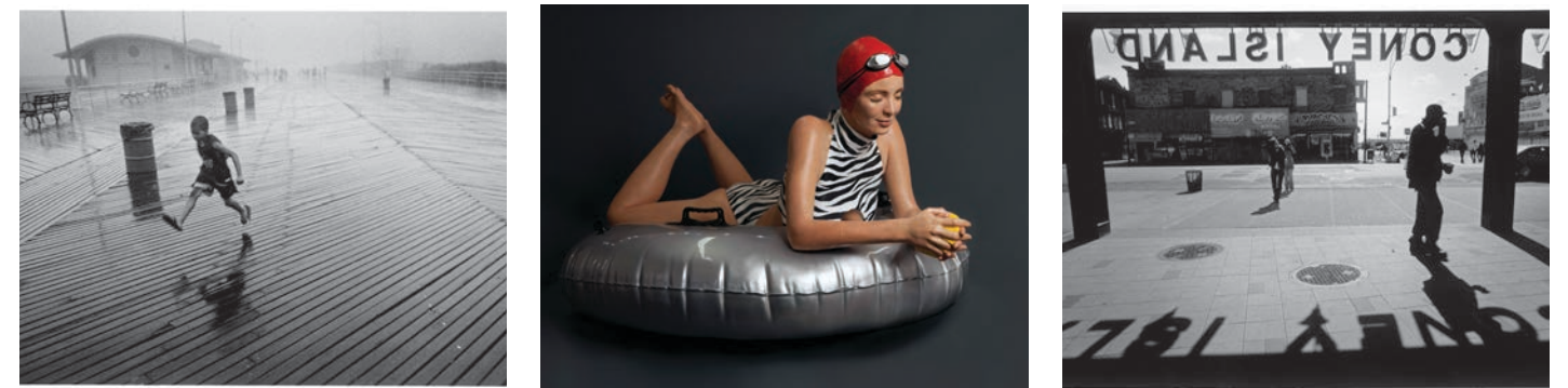
Boy Running in the Rain (2005) by Harvey Stein; Next Summer (2012) by Carole Feuerman; Coney Island Sign and Shadow by Harvey Stein

JUNE 30 - SEPTEMBER 10, 2017 FREE & OPEN TO THE PUBLIC