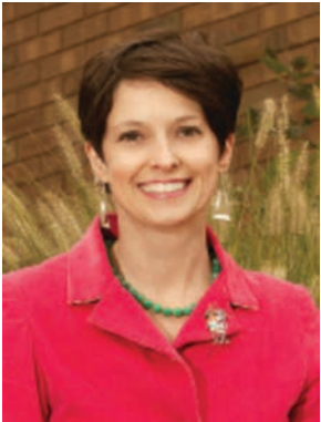
Whirlpool Corporation