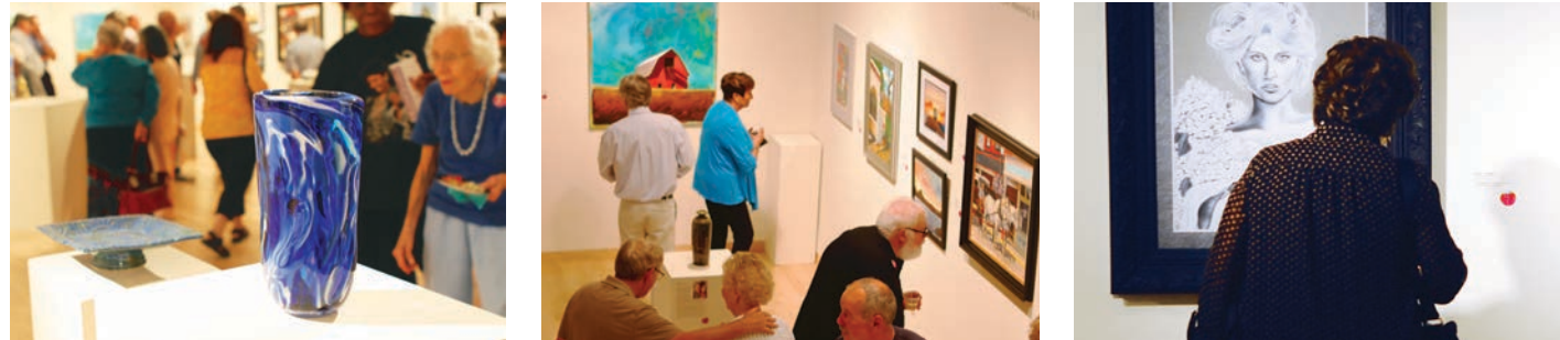
Images from the 2016 Krasl Art Center Members' Show.

SEPTEMBER 15 - OCTOBER 29, 2017 FREE & OPEN TO THE PUBLIC