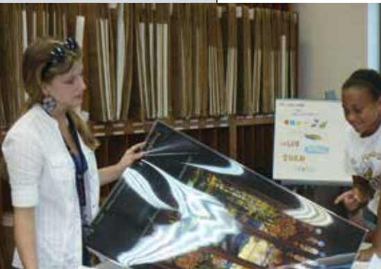
Students review Art Touch portfolios.

The Krasl Art Center's educational outreach programs provide cultural experiences to all audiences including our community members who have limited access to art.