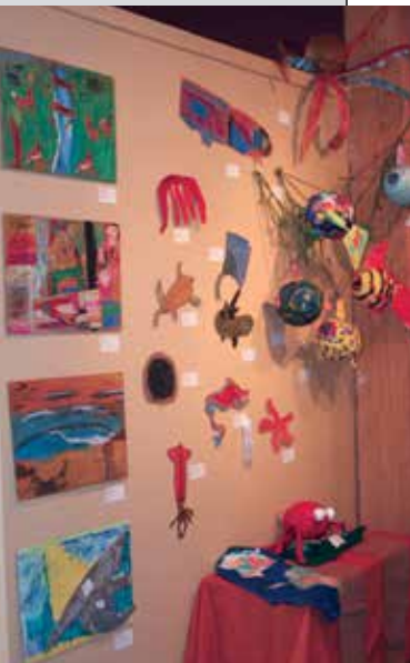
Student artwork on view.

In partnership with Berrien Regional Education Service Agency (RESA) and the Box Factory for the Arts. Reception refreshments courtesy of Clementines, Too.