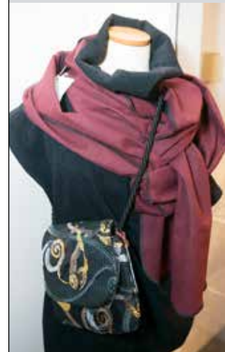
Artisan Market 2013.