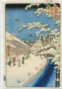
Number 112: Atago shita Yabu-koji (Yabukoji below Atago) , by Utagawa Hiroshige, 1857

The Floating World is part of a three-year national tour, containing approximately 53 Edo period woodblock prints. The exhibition was organized by The Lauren Rogers Museum of Art, located in Laurel, Mississippi. Management and development is provided by Smith Kramer Fine Art Services, an exhibition tour development company in Kansas City, Missouri. TM