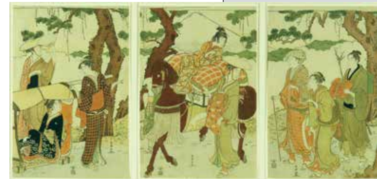
Returning from an Outing in the Hakone District by Katsukawa Shunchō, Circa 1788