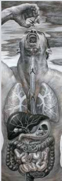
Digestion , 2012 To be featured in the artlab.