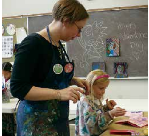
Play in our studios January 11!

Check out the studios, meet the teaching artists, and sample art making techniques at the Krasl Art Center Studio Open House. Games, musical performances, snacks, and discounted class registrations make for a fun afternoon for all ages, so bring your friends!