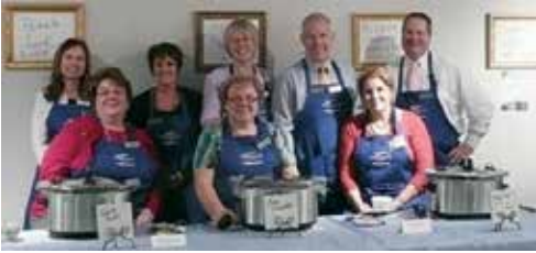
Edgewater Bank Staff Serve at Soup's On