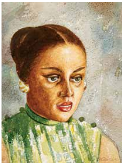
Aaron Douglas Portrait of a Lady, 1950 Watercolor on paper