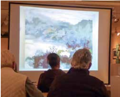
Image from the Artist's Slideshow and Potluck hosted this past December.