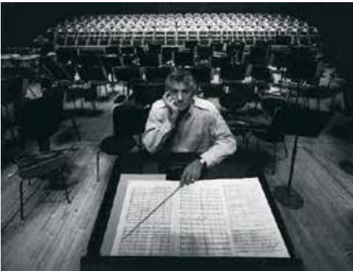
Leonard Bernstein

His portraits at once speak to his talent as a photographer and his unparalleled ability to capture the personality of his subjects.