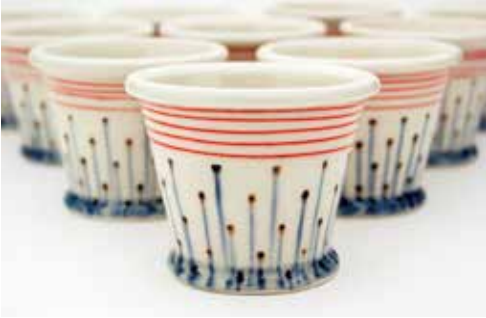
Porcelain Cocktail Cups by Sean O'Connell