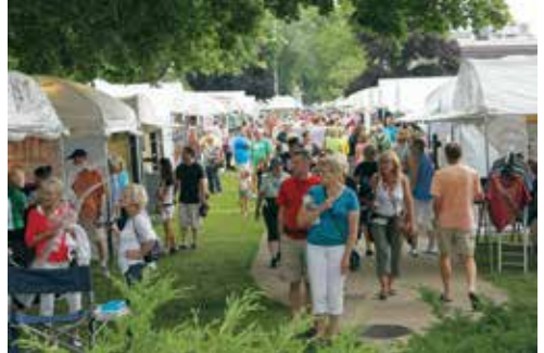
Art Fair 2014.

The 2014 Krasl Art Fair on the Bluff was another success for the Krasl Art Center. Many patrons commented on the outstanding quality of art and many artists had positive comments regarding the event. We are pleased to announce that the Krasl Art Fair on the Bluff increased its 2014 rank from #12 to #10 in Sunshine Artist magazine's 200 Best fine art and design shows. Thanks to the Art Fair committee, our sponsors and community partners, the KAC board and staff, and the 465 volunteers who contributed to this important recognition.